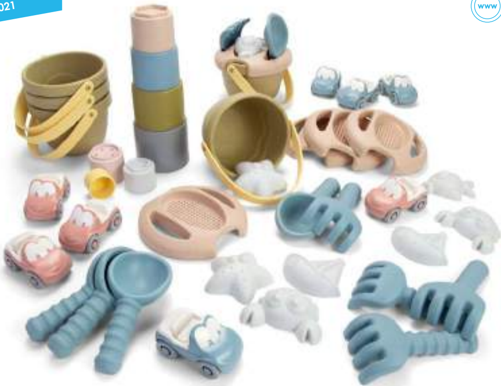
C2279 - Tiny Bio Plastic Sand and water set (43pcs)