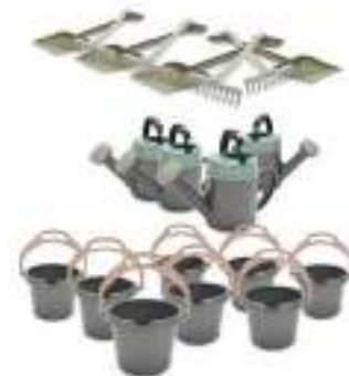
C8031* - Complete Mobile Green House, Benches & Garden Set (Pg 41)