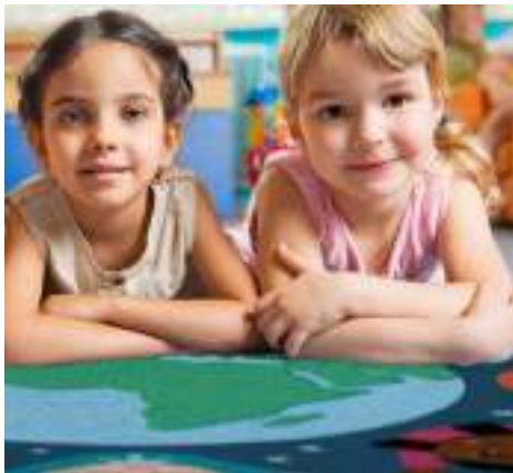
C3400 - Children Of World Ultrasoft Circular Carpet 100cm Diameter