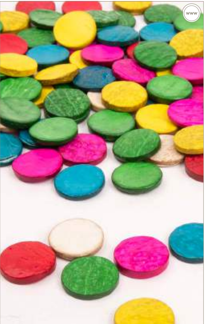
Coloured Coconut Shell Circles