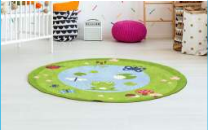
C3402* - Frog On Pond Ultrasoft Carpet 100cm