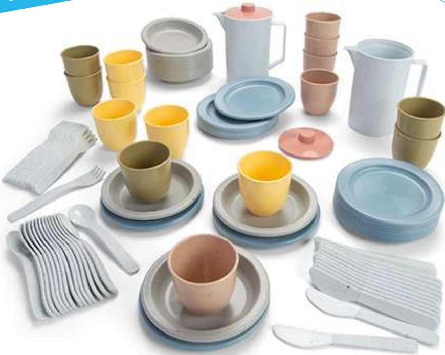
C2285 - Tiny Bio Lunch Set (94pcs)