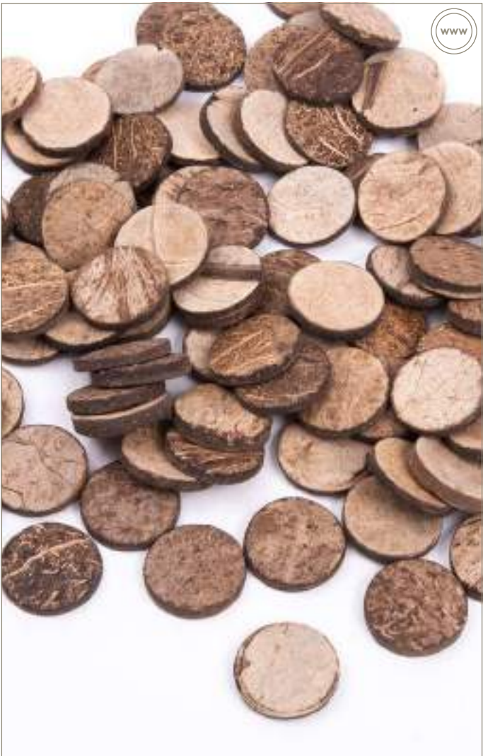
Natural Coconut Shell Circles