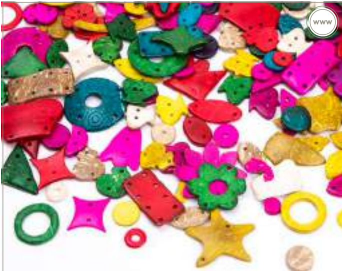
C4137 - Coconut Shell Assorted Shapes, Assorted Colours (250gms)