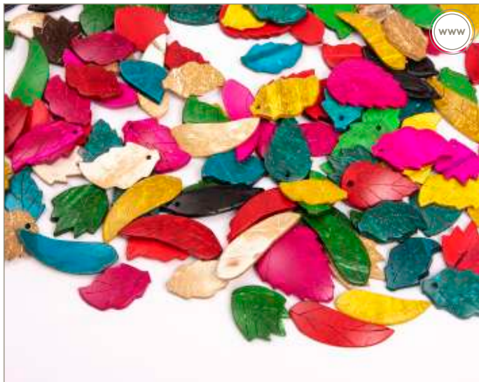
C4136 - Coconut Shell Leaf Shapes Assorted Colours (125gms)