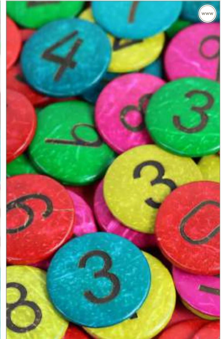
Coloured Number 0-9 Coconut Disc's C4148 - 2.5cm Pack 50 Assorted Colours C4147 - 3.5cm Pack 50 Assorted Colours