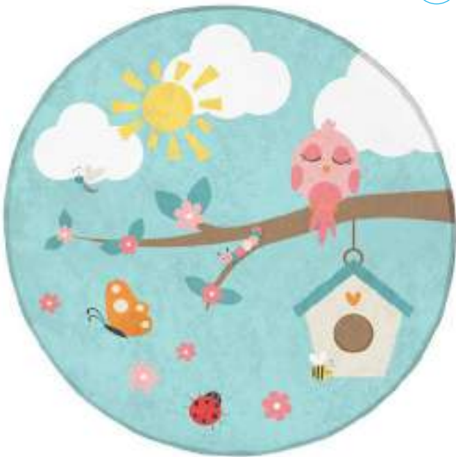
C3401 - Bird Tree Ultrasoft Carpet Diameter 100cm